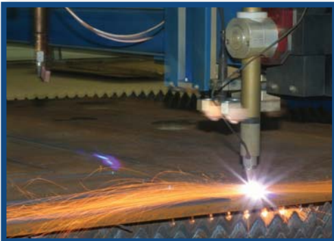
Intricate cuts for fabrication performed.