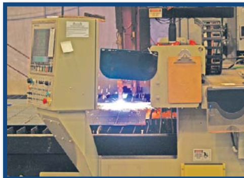
WearPads cut out of WC500 Plate.

(See reverse for Plasma Cutting Services Information.)